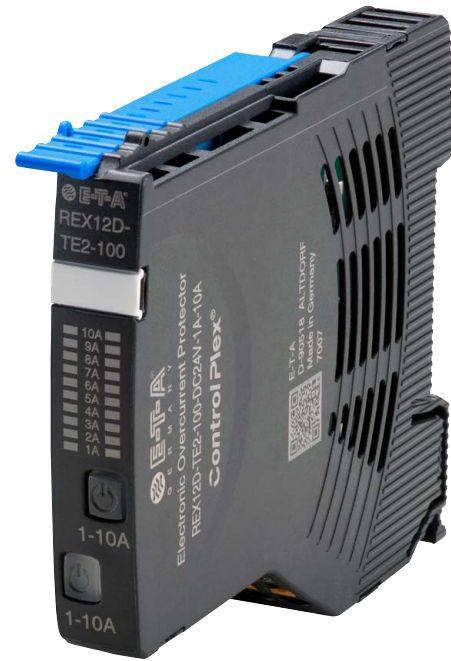
REX12D-TE2 circuit protector