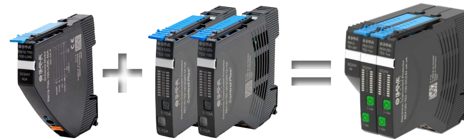
EM12-T supply module

the button on the circuit protector. With an installation width of only 37.5 mm the Quat-Pack creates significantly more space in the control cabinet than similar devices on the market. Additionally, it clearly cuts costs for inventory and purchasing because the four-channel unit needs only a single part number.